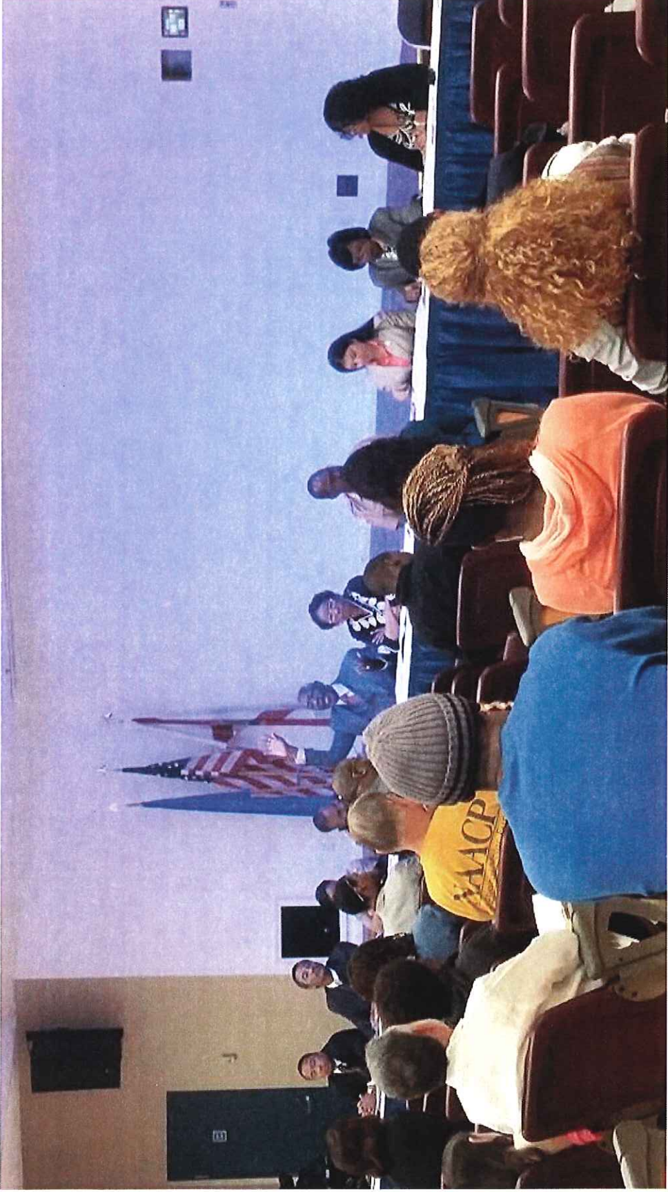
Miami-Dade Community Relations Board Police Trust Forum